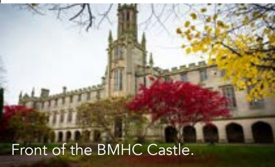
Front of the BMHC Castle.