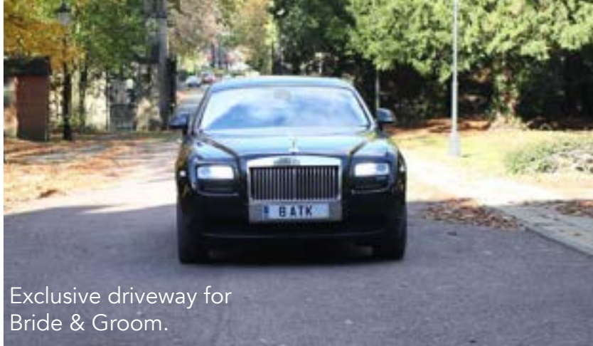
Exclusive driveway for Bride & Groom.